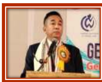
Shri M. Harekrishna, IAS Hon'ble Commissioner Higher & Technical Education Government of Manipur